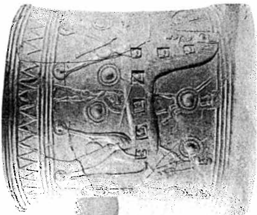
▲ This carving from an ancient Greek storage jar is the earliest surviving image of the Trojan Horse. It dates from around the time of Homer.

Schliemann, archaeological discoveries suggested that the stories of the Trojan War may have been based on real cities, people, and events.